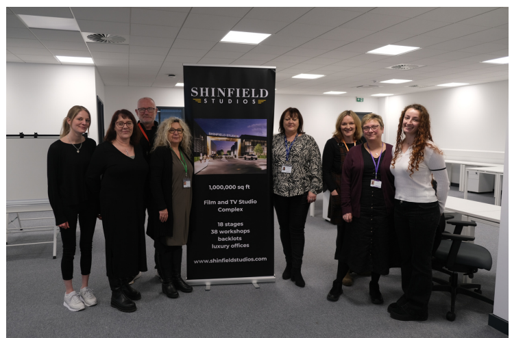
The Berkshire Careers Hub Team at Shinfield Studios during an Enterprise Adviser Meeting

If you have any feedback on our website, please email us at: careersandenterprise@thamesvalleyberkshire.co.uk .